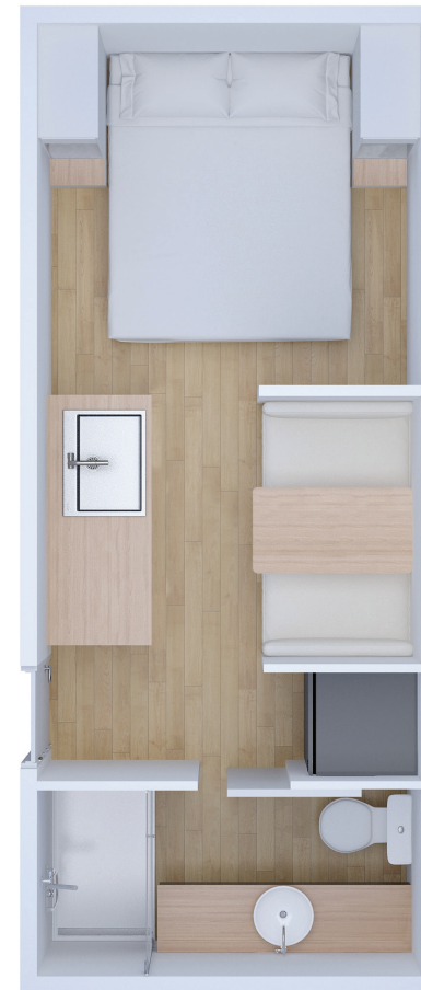
18'6" • CAFE LOUNGE