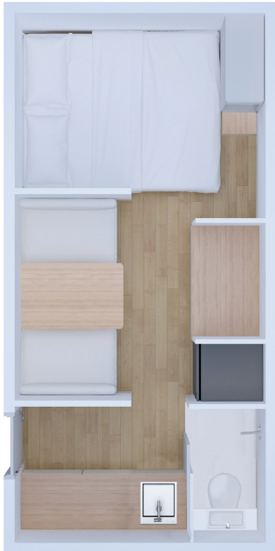
15'6" • EAST WEST