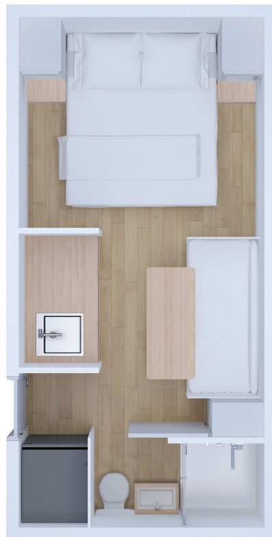
15'6" • NORTH SOUTH