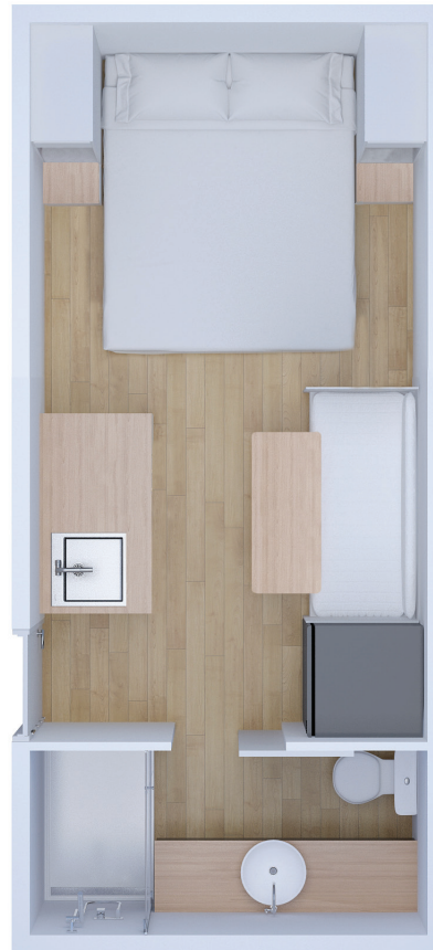
17' • STRAIGHT LOUNGE